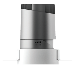
3W,6W Fixed Type