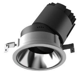
12W,20W,35W Adjustable Type