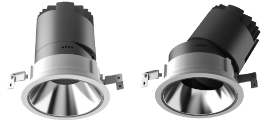
12W,20W,35W Fixed Type