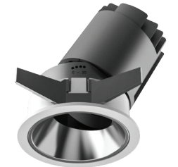
3W,6W Adjustable Type